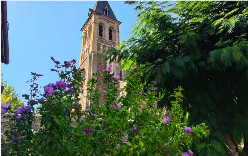
Saint Izaire