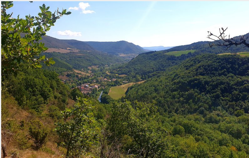
Tour de Clipis par la Frégière (Roquefort Tourisme)