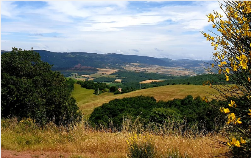
Vue vers la vallée du Dourdou