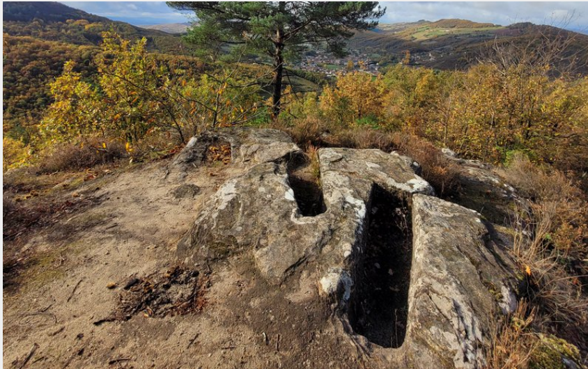
Le Joncas (Roquefort Tourisme)