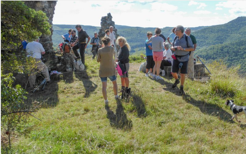
Les ruines du château (Escapade St-Jeantaïse)