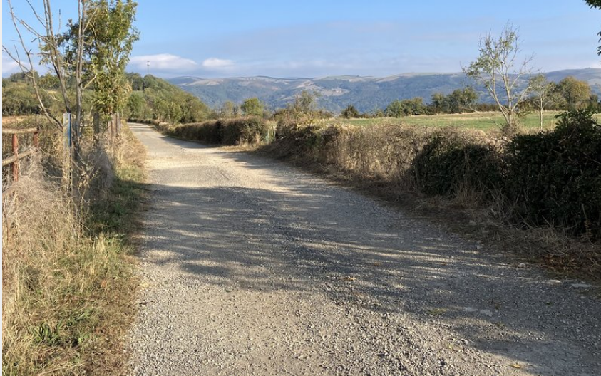
Point de vue sur la Vallée du Lot