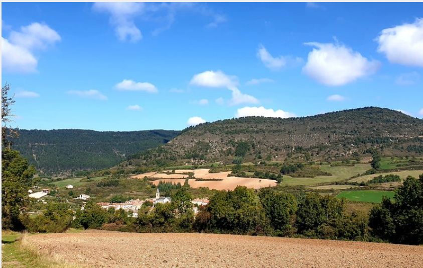
La Loubière (Roquefort Tourisme)