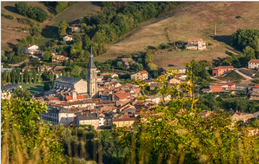
Vabres l'Abbaye (Virginie Govignon)