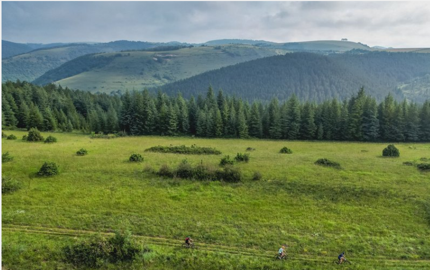
VTT (Roquefort Tourisme)