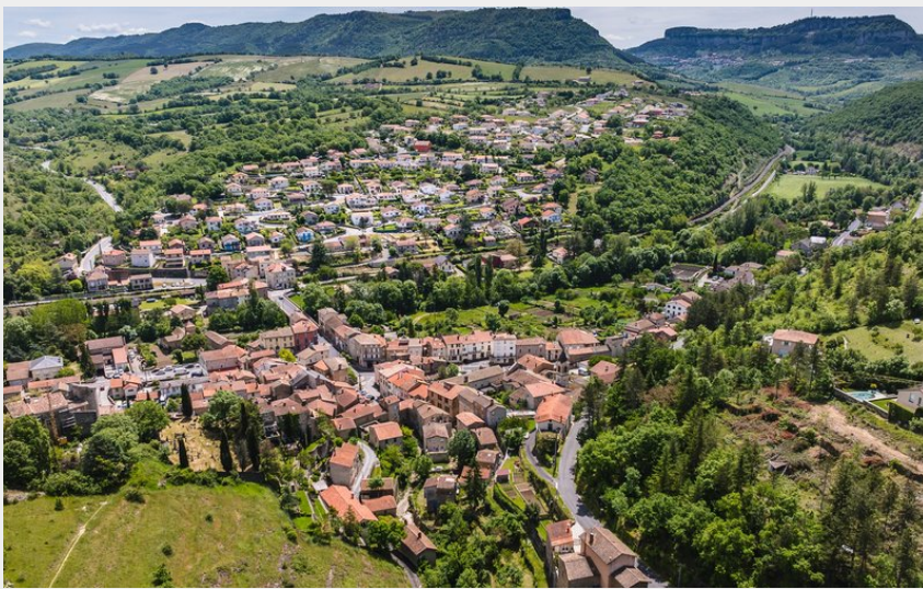
Vue sur le village de Saint-Rome de Cernon (Virginie Govignon)