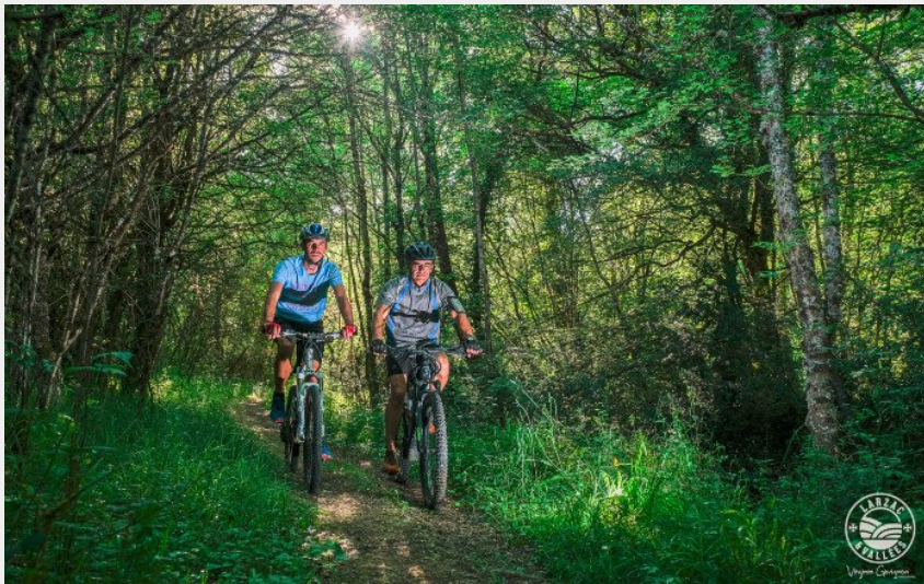
Le long du Durzon...