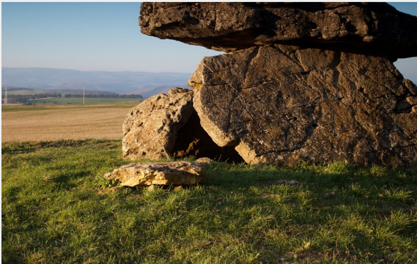
Dolmen de Tiergues