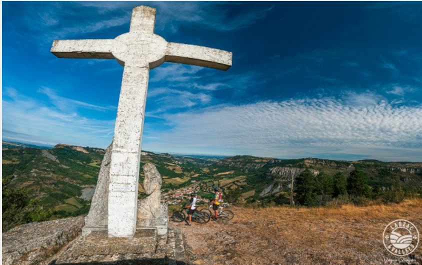
Le panorama depuis la croix de Gréponac