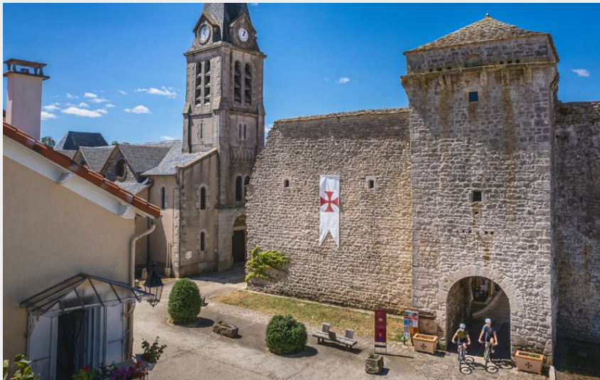
Dans le village de La Cavalerie