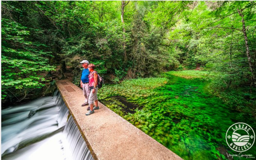
La Source du Durzon