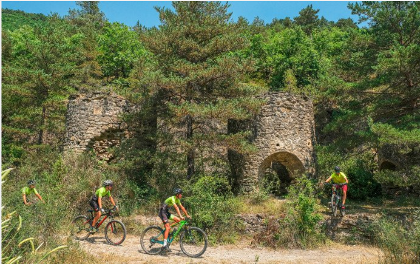
Les fours à calamines dans le ravin des Valettes