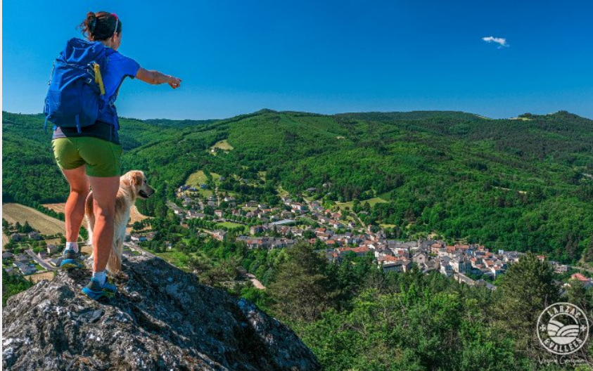
Panorama depuis Notre-Dame de la Sentinelle