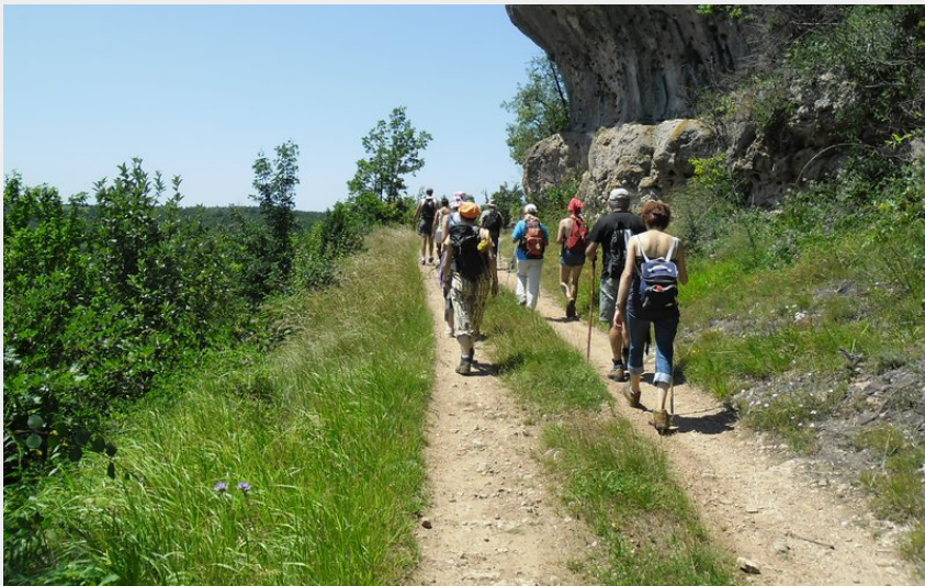
Sur le causse...