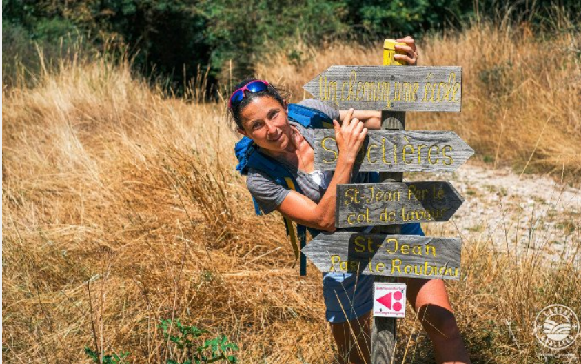
Sur le circuit...