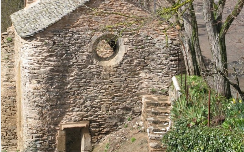
Chapelle de la Bastide (LuciePinot)