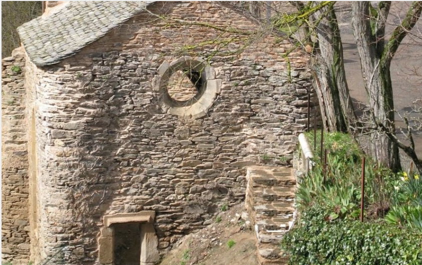
Chapelle de la Bastide (LuciePinot)