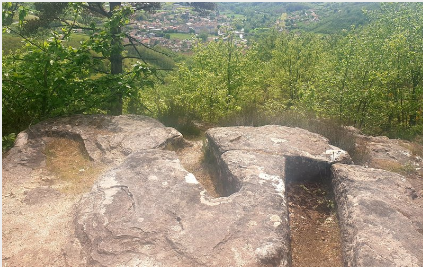
Tombes rupestres du Vieuzet (Roquefort Tourisme)