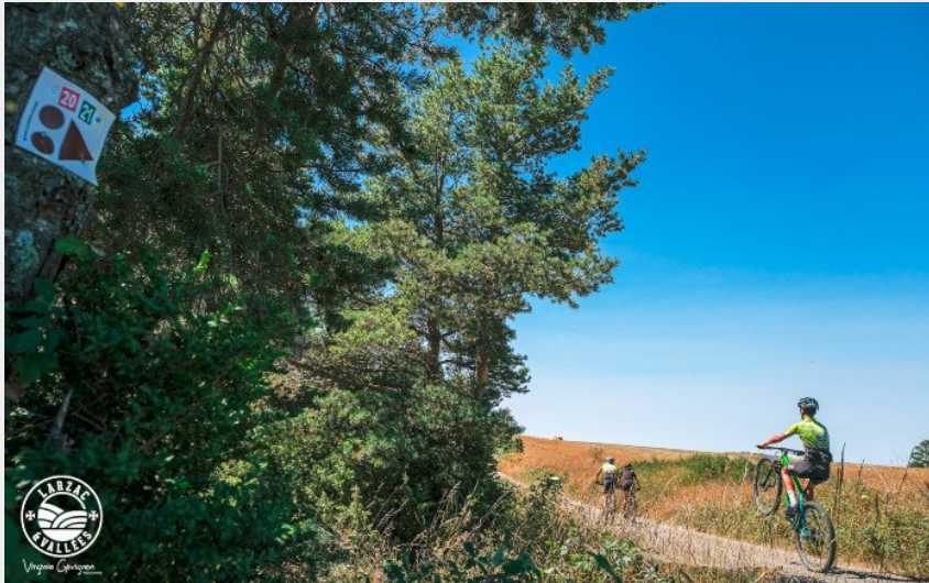
Sur le causse bégon...