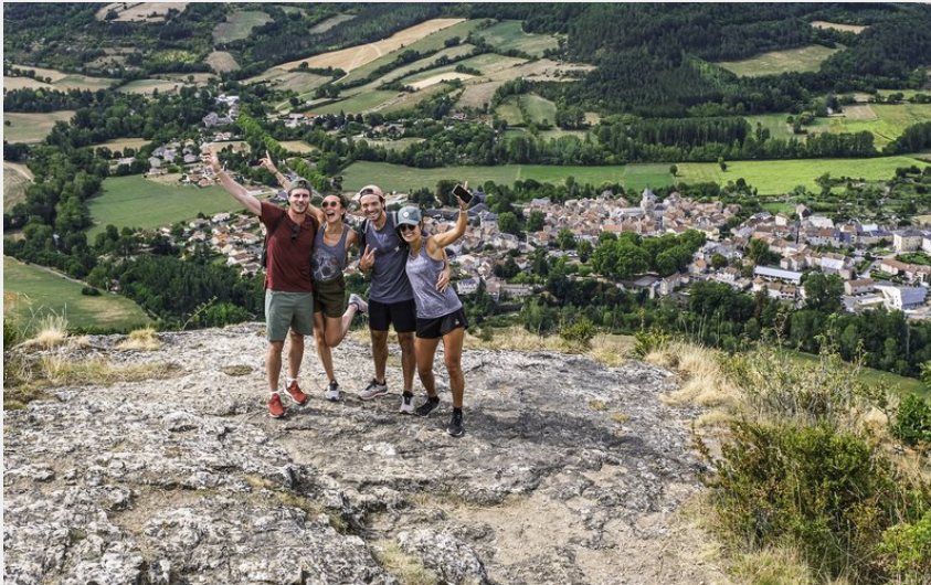
Panorama sur Nant depuis le Roc Nantais