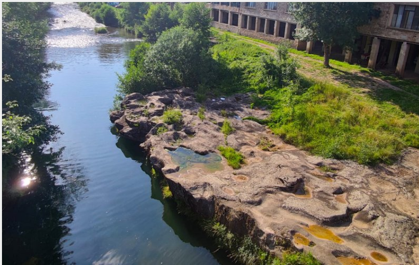
Traversée de la Sorgues depuis le pont neuf de Lapeyre (Roquefort Tourisme)