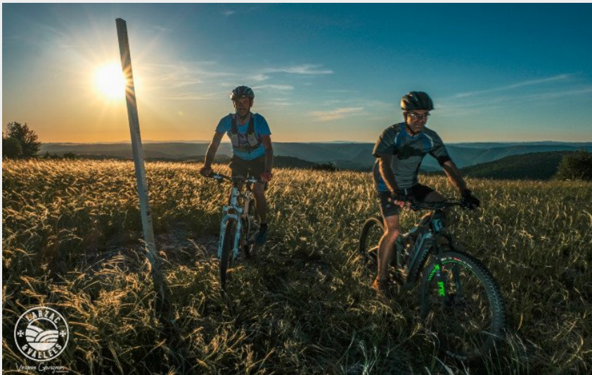
Sur le Puech Bassel