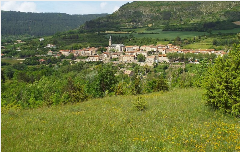
Vue sur le village de Saint-Félix-de-Sorgues (Delphine Atché)