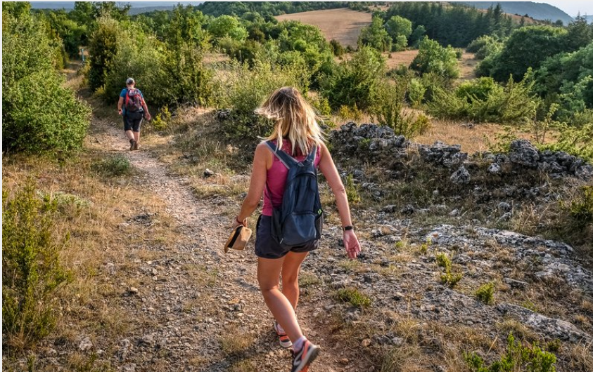
Sur le plateau du Guilhaumard