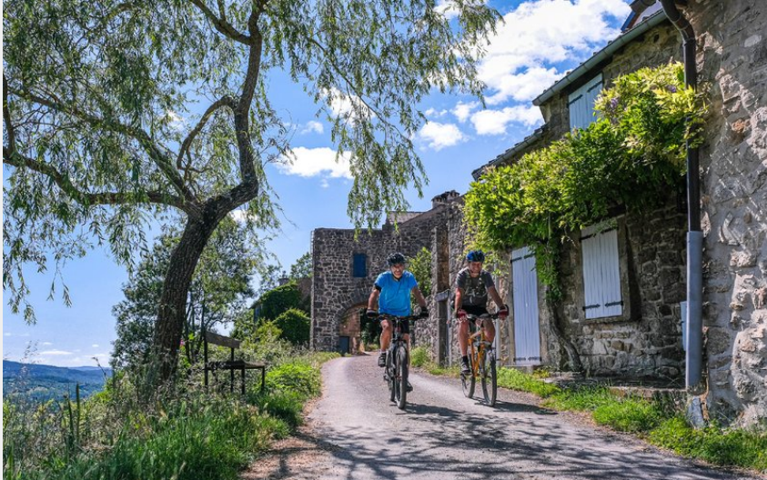
Dans le hameau d'Algues