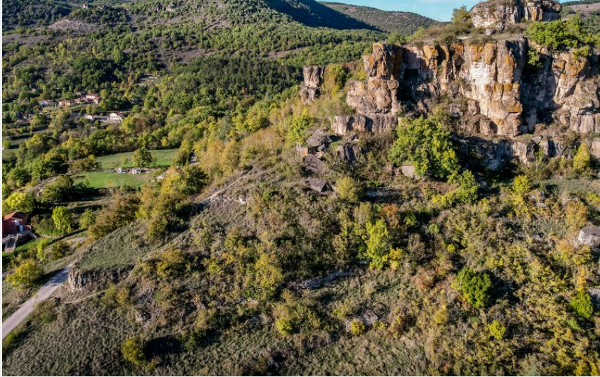
Rocher de Caylus (Virginie Govignon)