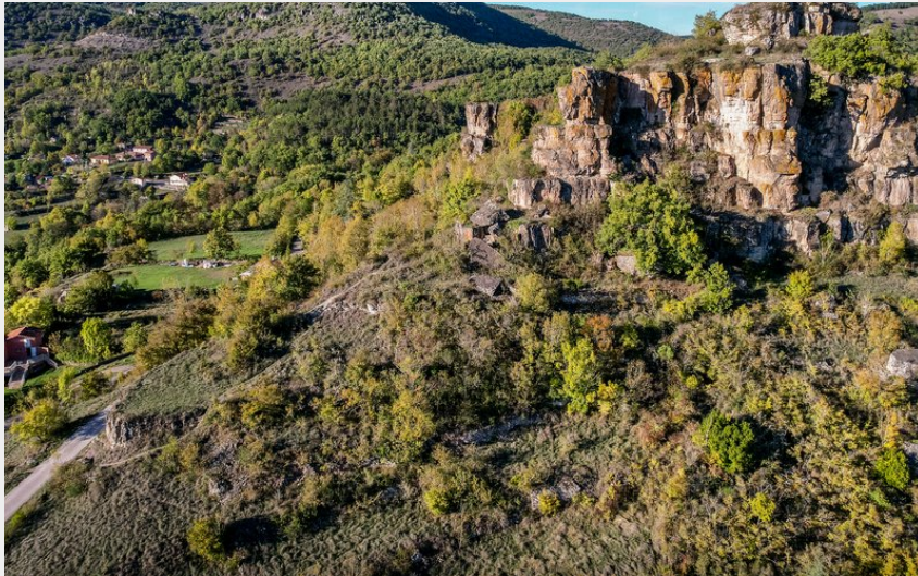
Caylus (Virginie Govignon)