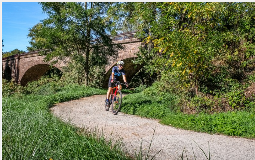
Berges de la Sorgues (Virginie Govignon)