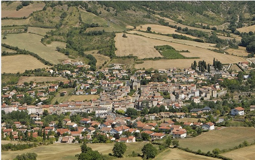
vue générale du village de Saint-Georges de Luzençon (Eric Teissèdre)