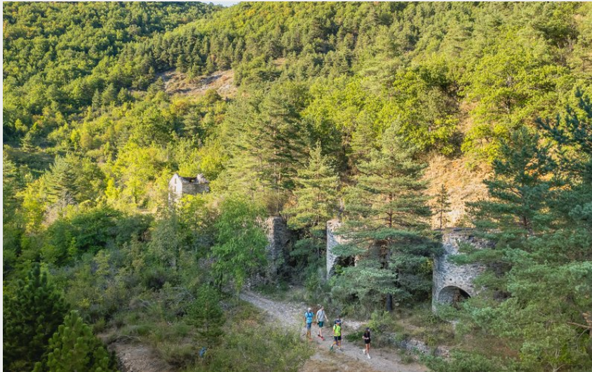
Le ravin des Valettes et ses fours à calamine