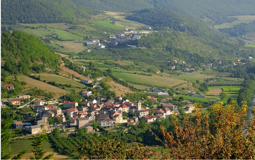
vue sur Paulhe (Tordjman)