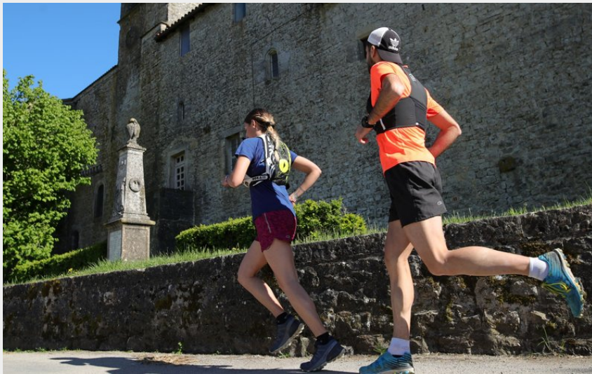
Fort de Saint-Jean d'Alcas