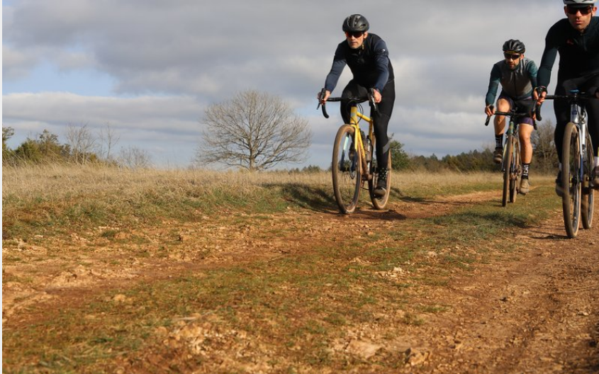
Plateau de la Loubière (CB PNR Grands Causses)