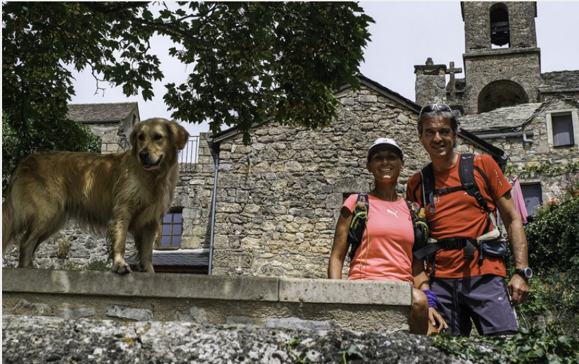
Le village perché de Cantobre