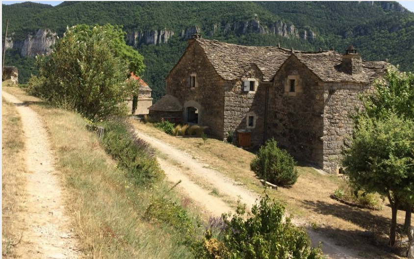
Randonnée Piédestal de fontaneilles