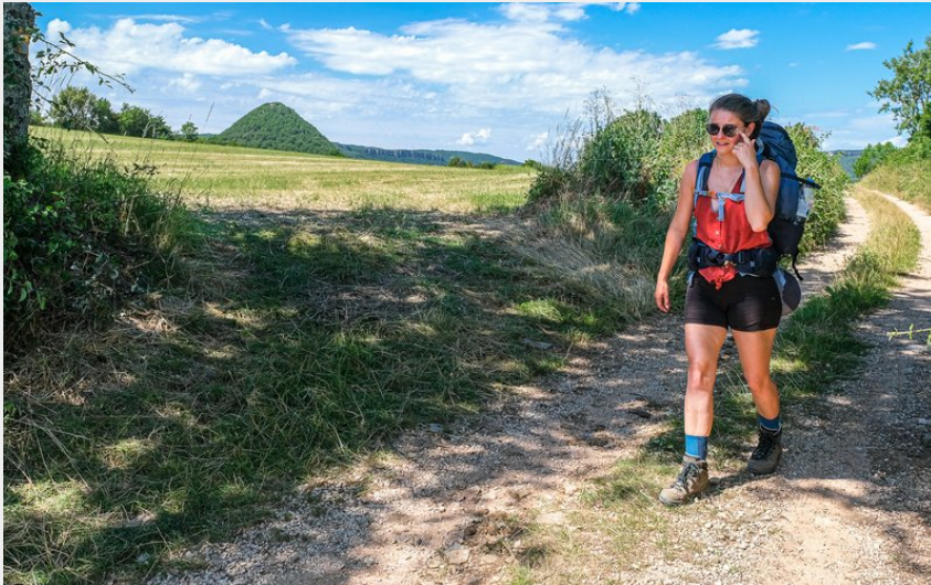
Sur le chemin autour du St-Alban