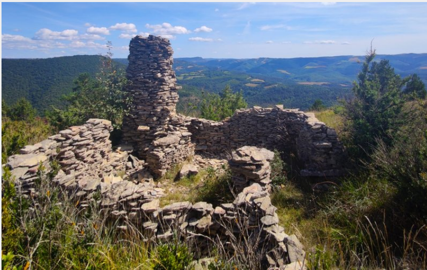
Crêtes et buissière du plateau de Mascourbe