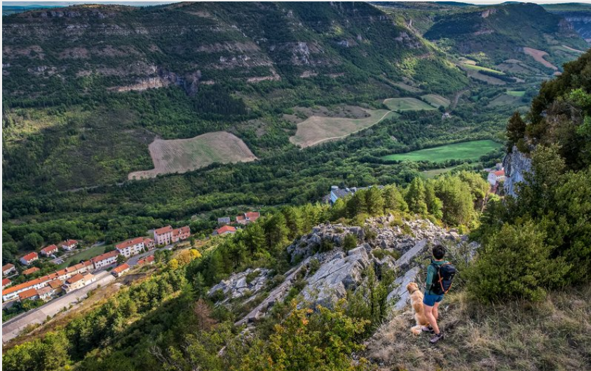
Les éboulis du Combalou (Virginie Govignon)