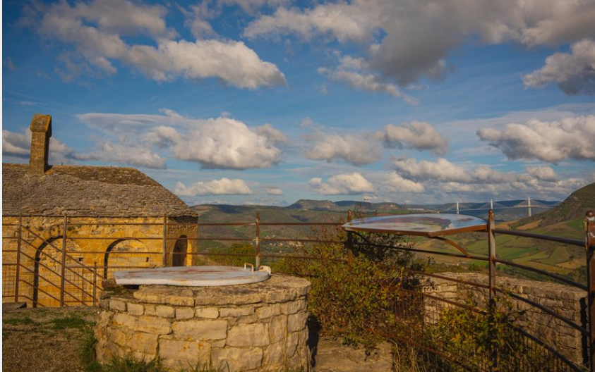
Point de vue depuis Luzençon (Enzo Planes)