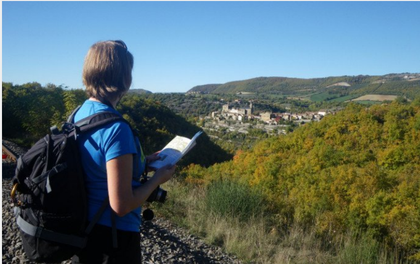
La Bastide-Pradines vue depuis la gare (Elodie Calazel)