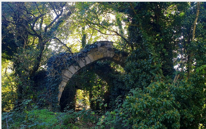
Le tour d'alzac (Roquefort Tourisme)