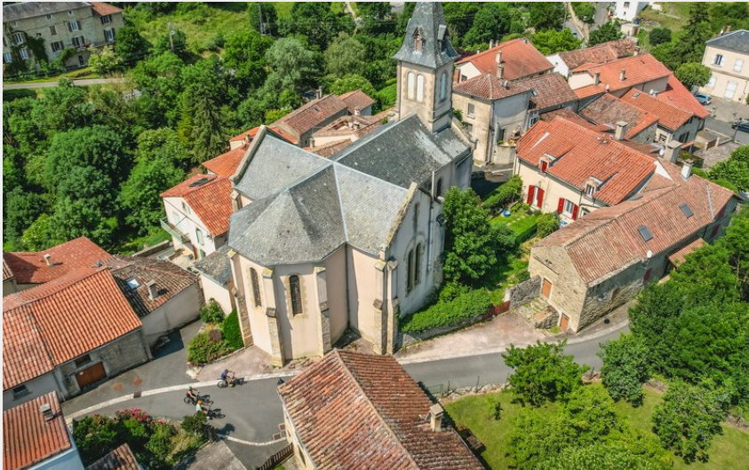
Saint-Jean d'Alcapiès