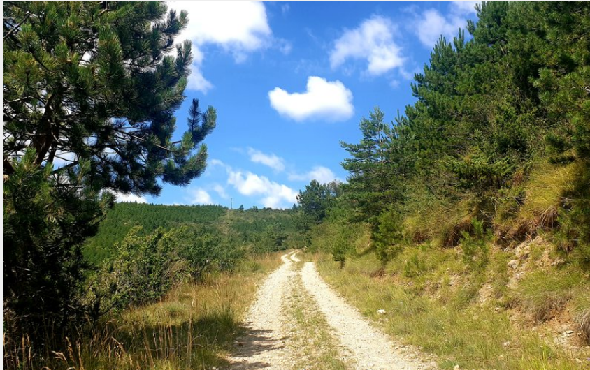
Piste forestière montée au plateau de Mascourbe (Roquefort Tourisme)