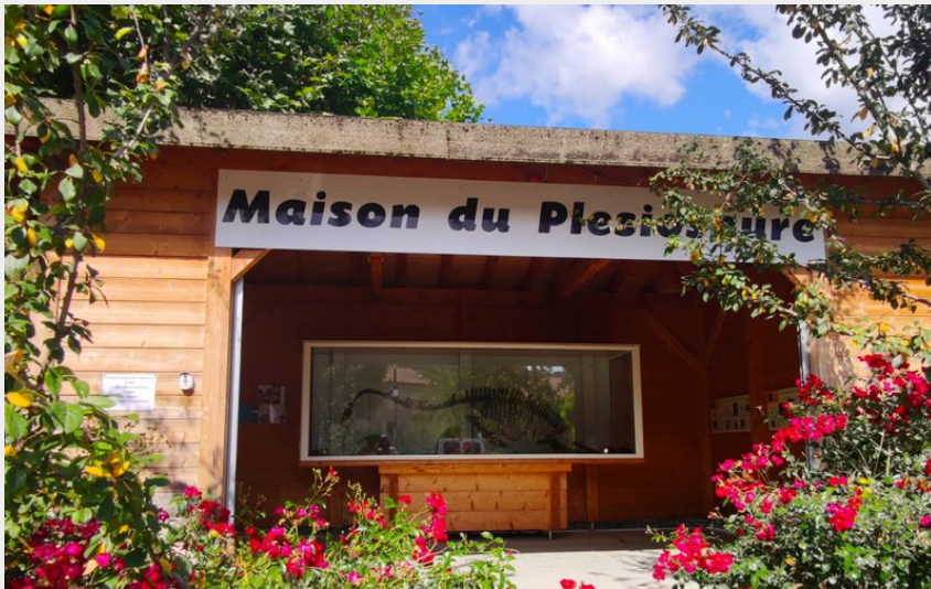
Cirque de Tournemire (Roquefort Tourisme)