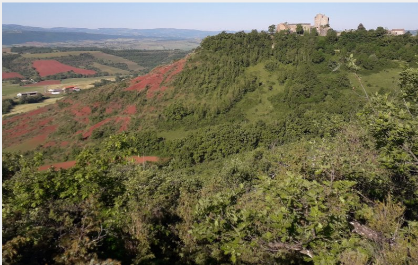
Rougiers & arrivée au château de Montaigut (Francis Puech)